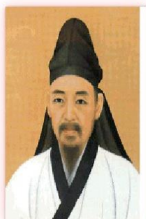
Yi I (1536 - 1584)