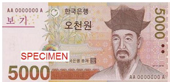
5,000 won note - Yi Yul Gok