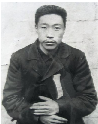
Ahn Joong- Gun