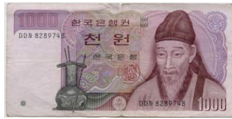
1,000 won note