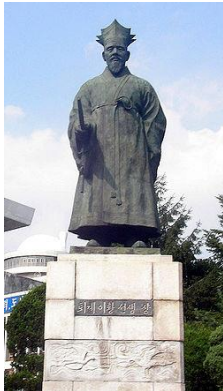
Statue of Yi Hwang (Namsan Seoul)